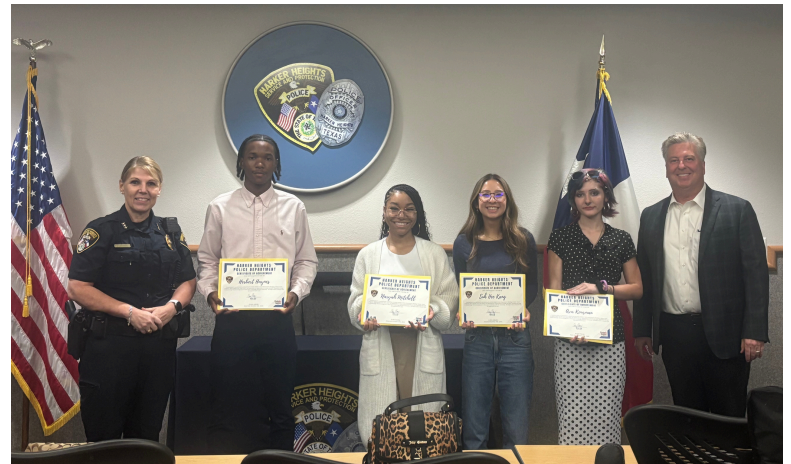
CONGRATULATIONS GRADUATES OF OUR BABY PROGRAM THURSDAY OCTOBER 9, 2025.